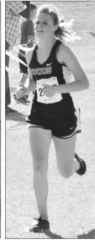
Towns County Cross Country